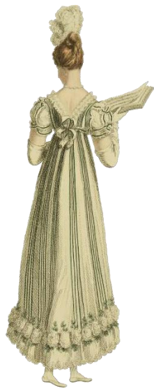
Ackermann's Repository 1815 Evening Dress

(Please advise by 10/10/22 of numbers coming for Catering)